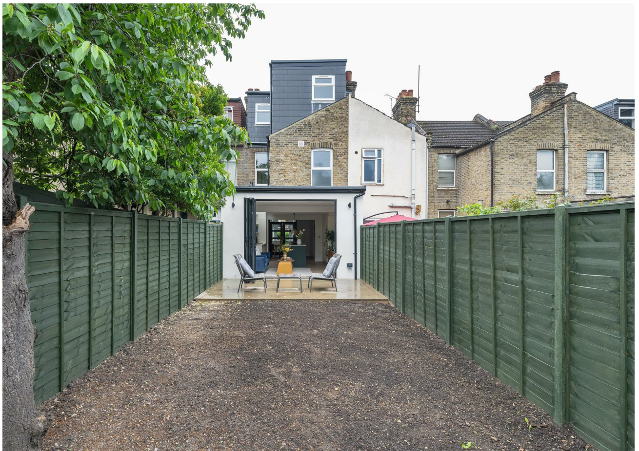
FOLLOW US → @STOWBROTHERS STOWBROTHERS.COM