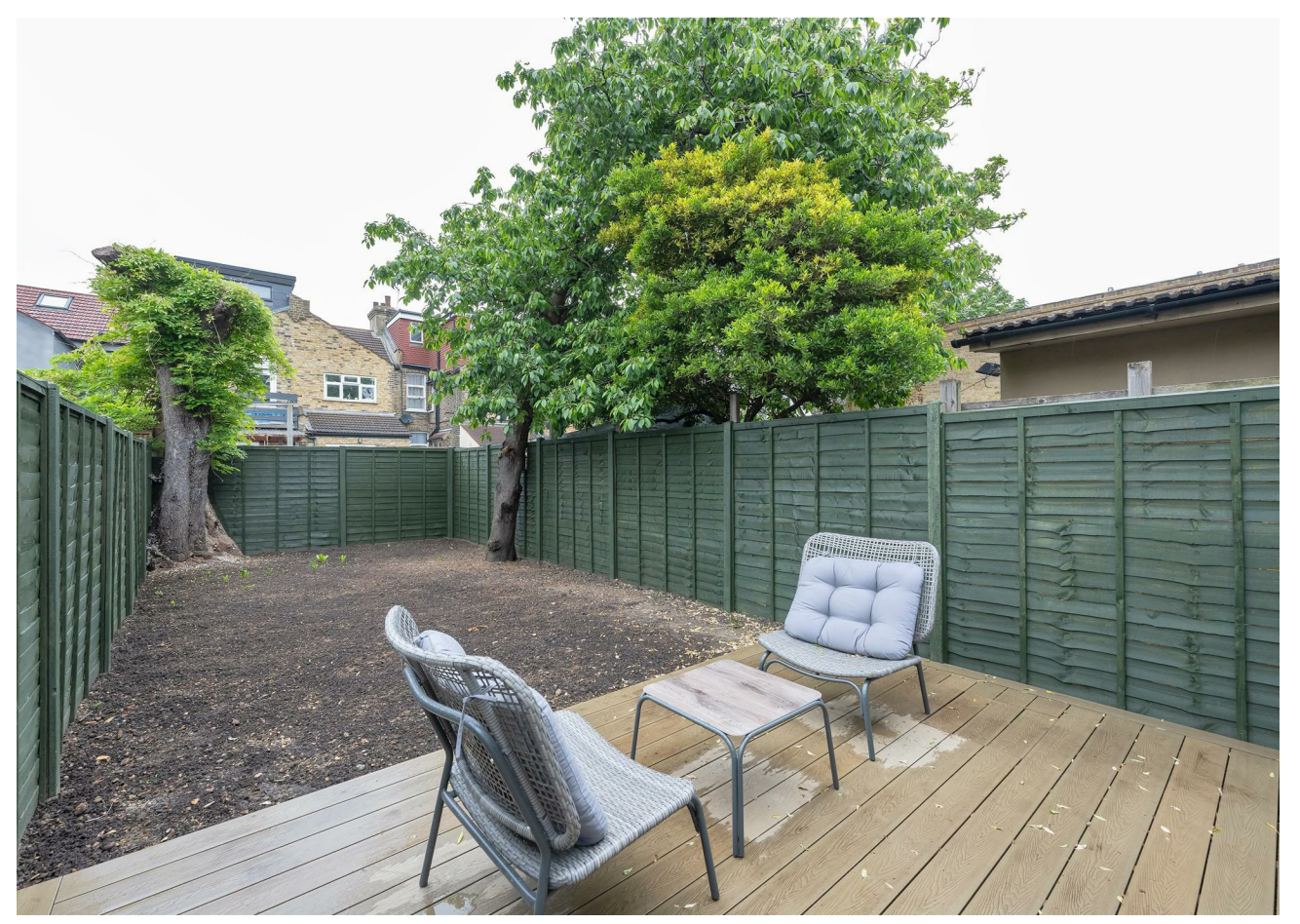
FOLLOW US → @STOWBROTHERS STOWBROTHERS.COM