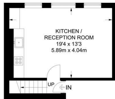
FIRST FLOOR 286 SQ FT / 26.6 SQ M

All measurements are approximate and for display purposes only