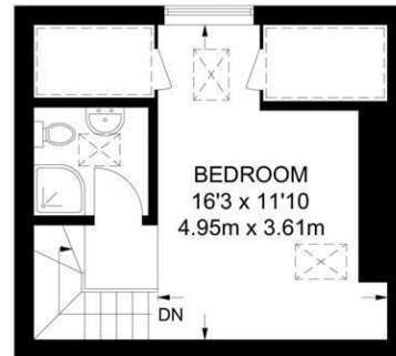
SECOND FLOOR 295 SQ FT / 27.4 SQ M