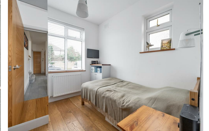
Bedroom 12'11" x 11'11"